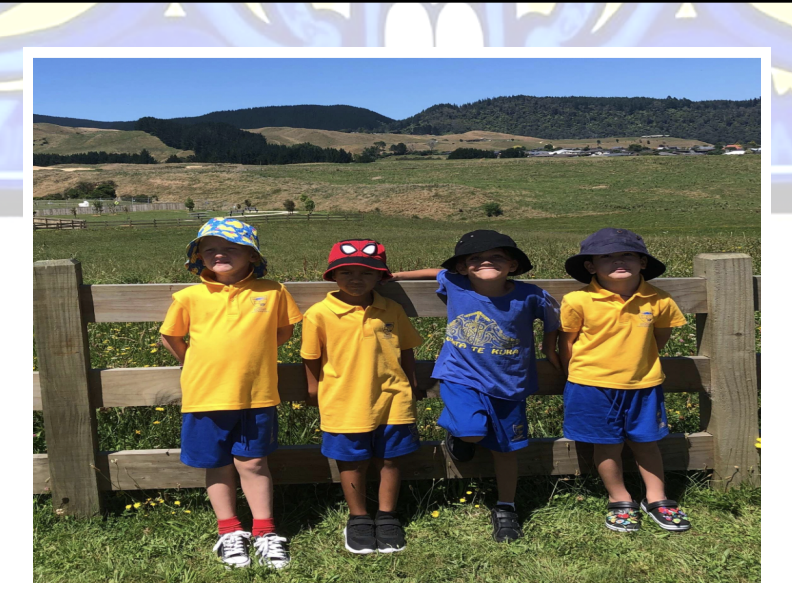
Manawa Tahi ākonga enjoying our local community.

1ST FEBRUARY - SCHOOL STARTS FOR ALL TAMARIKI 6TH FEBRUARY - WAITANGI DAY (SCHOOL CLOSED) 12TH FEBRUARY - PŌHIRI FOR NEW ĀKONGA & WHĀNAU 9.45AM 26TH FEBRUARY - MEET THE TEACHER / GOAL SETTING WEEK 29th FEBRUARY - IRIIRIKAPUA WHĀNAU HUI / GOAL SETTING 25th MARCH - 28th MARCH - NOHO MARAE WEEK (ALL CLASSES) 29TH MARCH - GOOD FRIDAY (SCHOOL CLOSED) 1ST & 2ND APRIL - EASTER (SCHOOL CLOSED) 12TH APRIL - LAST DAY OF TERM 1 (NORMAL SCHOOL DAY) For regular updates visit - School Facebook / DOJO Email: office@owhata.school.nz Ph: (07) 345 6051