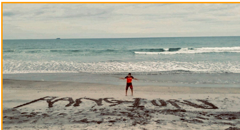
Photo of the week: Kemara Whareaitu represents Rangiuru from Pukehina!

We do know of a few more essential workers - please send in a photo - if all we can give you is a small acknowledgement for your service, we would appreciate that opportunity.