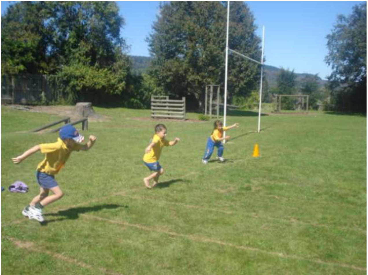
The start of one of the races held on Junior Athletic Day.