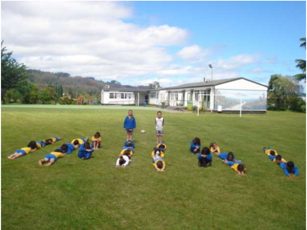
On 11.11.11 Room 6 made a people picture of the date.