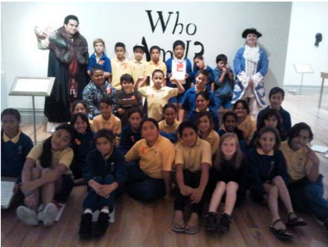
Years 5 and 6 from Rooms 3 and 7 visited the Museum to see the exhibition “Who Am I” yesterday.