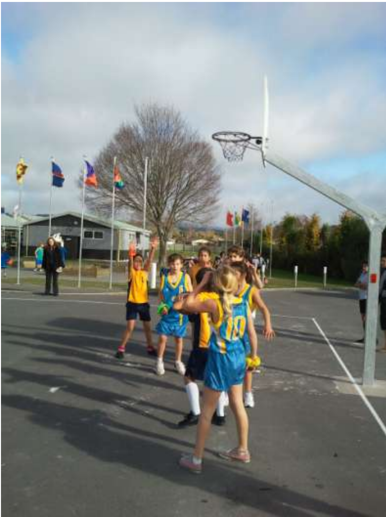
Pictured are Our miniball team playing against Westbrook Primary School yesterday at Rotorua Intermediate. We won 36-12.