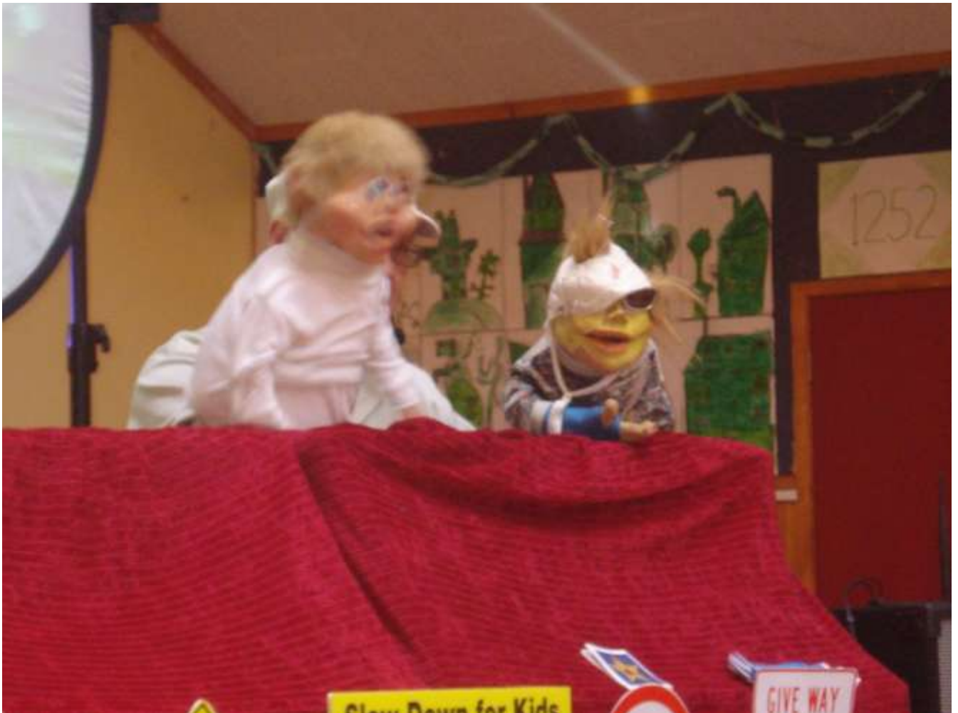
Part of the puppets involved in the Road Safety Puppet Show that was at school last Thursday.